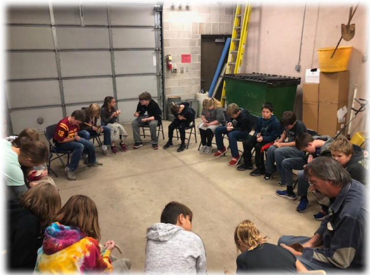
ABOVE: 5 th grade students making arrowheads. BELOW: 5 th grade students enjoying the Big Island Rendezvous in Albert Lea, Minnesota.

Our most recent project has been the annual Christmas food drive, we will be giving these items to our food bank located in our school. The entire school is involved in this project because homerooms compete to see which class can collect the most items. As a Character Counts school, this activity is just one of the many ways we demonstrate the 6 pillars of character. The 5th graders collect, count, and sort all of the donations. We will take our final collection on December 6th and post our totals in the January newsletter.